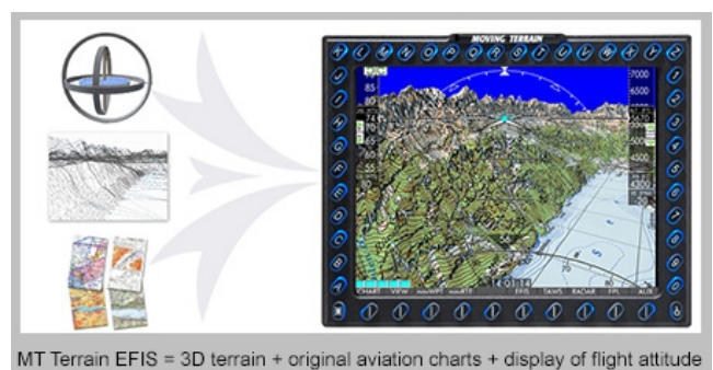
MT Terrain EFIS = 3D terrain + original aviation charts + display of flight attitude

Operation in unknown terrain or approach to unknown terrain? Minor visibility? Get familiar with the terrain via MT Terrain EFIS! It will provide significant improvement of position awareness & orientation in flight . Decide yourself which chart shall be employed for 3D – individual charts can be integrated, too.